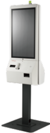
Dual Sided Operation