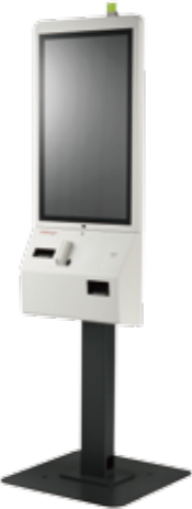
Single Sided Operation